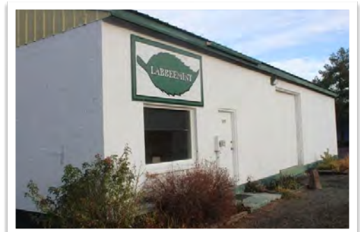
Our new home, Labbeemint Building

A lot changed for the Food Pantry in 2024! If you've been following our struggles with finding a new location, then you know it has been a roller coaster ride. We do have a new building, just not the one we planned on.